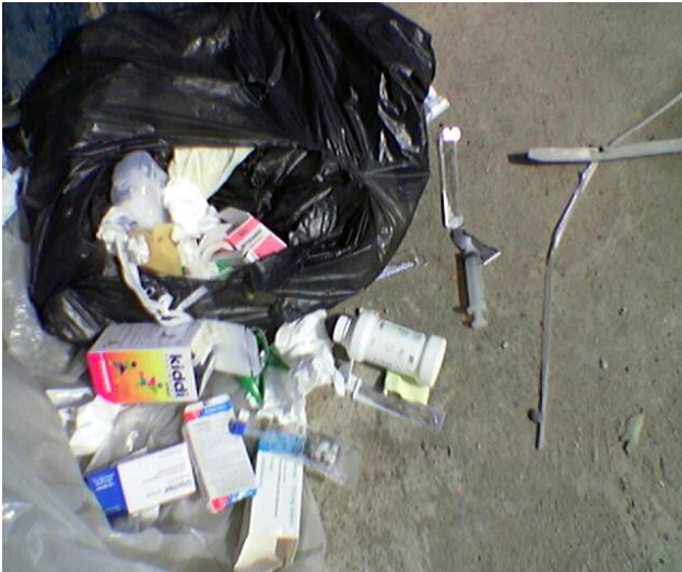
Fig. 2 General waste bags containing hazardous waste